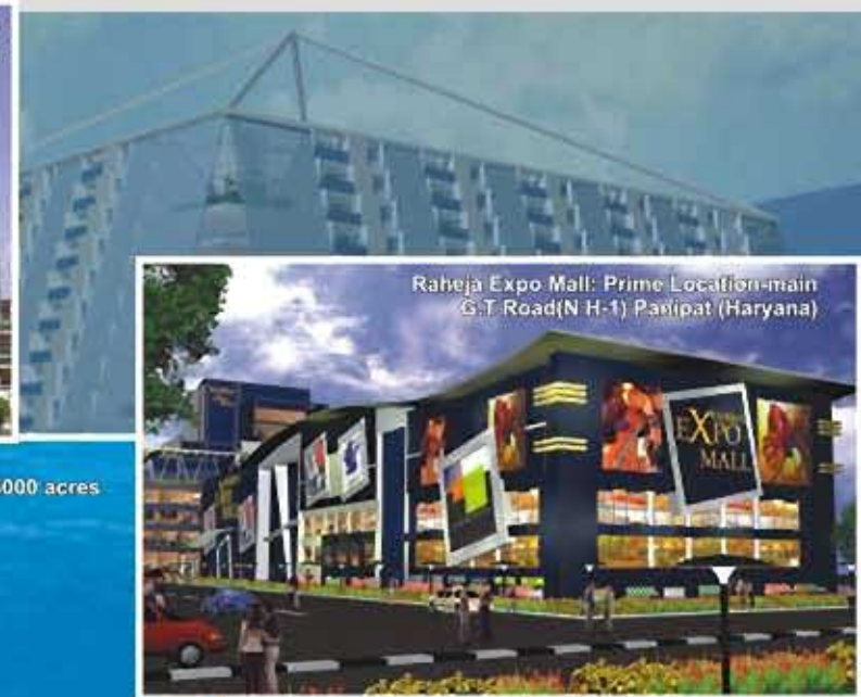
Raheja Expo Mall: Prime Location-main G.T. Road(N.H-1) Paripat (Haryana)