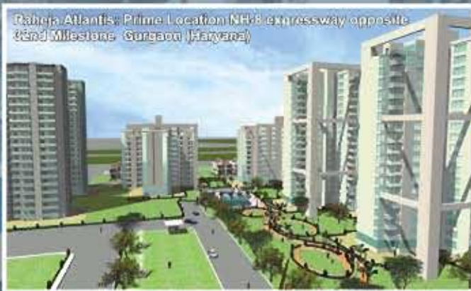
Raheja Atlantis: Prime Location NH8 expressway opposite 2nd Milestone Gurgaon (Haryana)

Little surprise that today Raheja's is better recognized for its quality, timely execution, innovative technology, value additions and customer satisfaction.