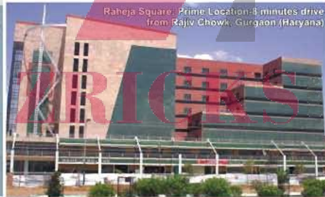
Raheja Square: Prime Location-8 minutes drive from Rajiv Chowk, Gurgaon (Haryana)